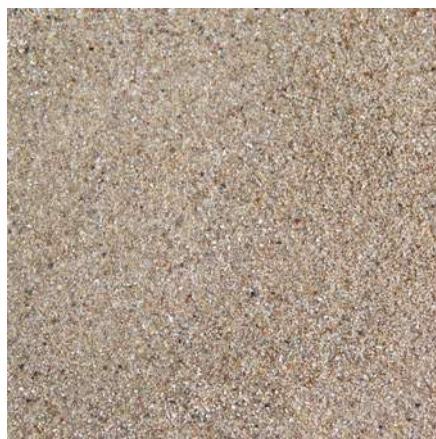
Quarz Einkehersand hell