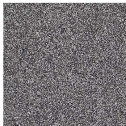
Granit Einkehersand hellgrau