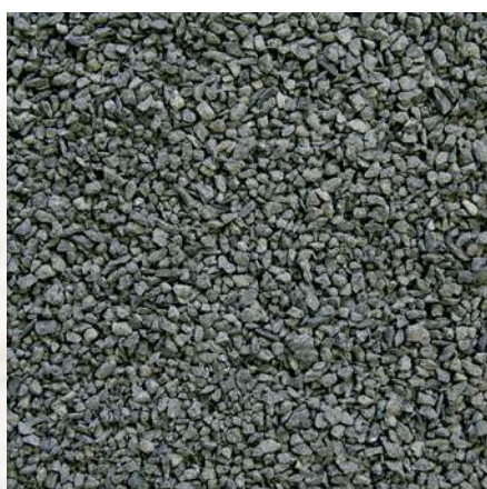
Basalt Fugensplitt anthrazit